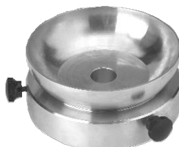
COLLECTOR HUB/BAFFLE COMBO